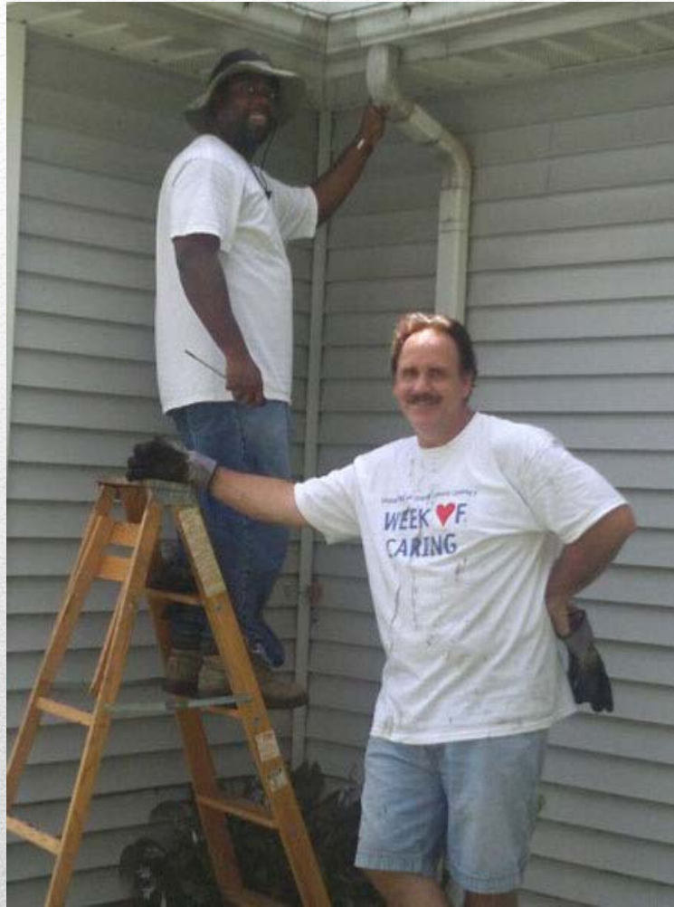
United Way Week of Caring House Repairs for Seniors