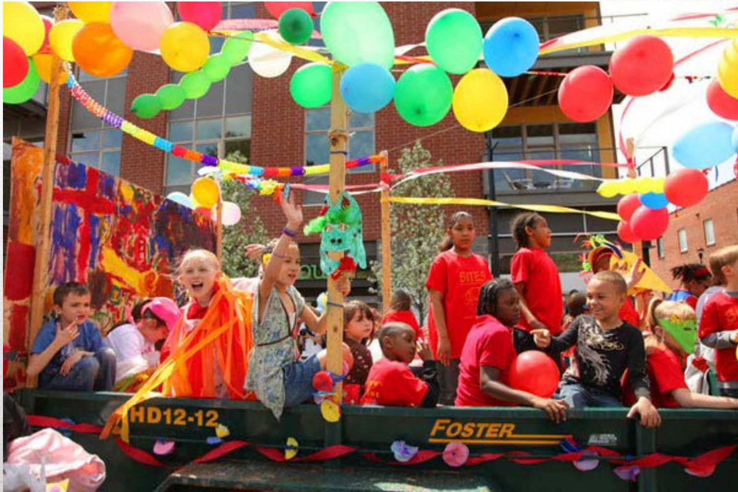
Big Parade- for all Ages