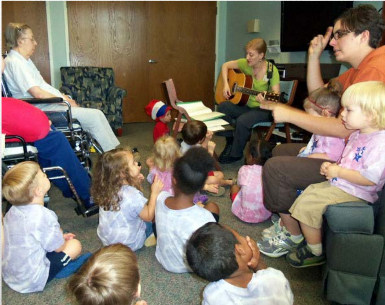
Intergenerational Music at Kendal