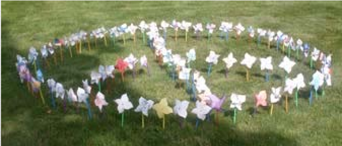
Group Art - Peace Pin-Wheels