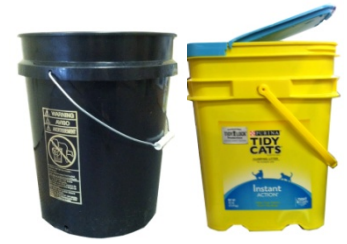
5 Gallon Plastic Buckets