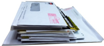
Paper Newspaper Envelopes Mail Phone books Magazines