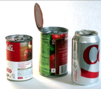
Metal Aluminum cans Food cans (remove any food or liquid)

Be sure your recyclables are EMPTY, CLEAN and DRY before placing them in your recycling cart.