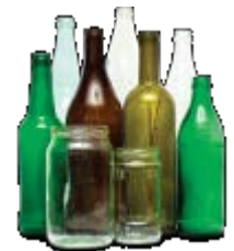
Glass Bottles Jars (remove any food or liquid)