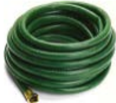
Ropes, Chains, Cordage, Garden Hoses