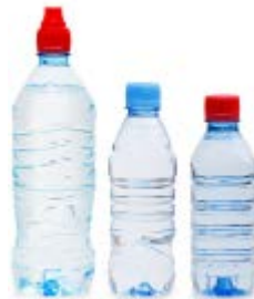
Plastic Water bottles Soda bottles Milk jugs Shampoo bottles Detergent containers (remove any food or liquid)