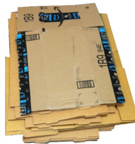
Cardboard Flattened boxes Food boxes with liners removed File folders Poster board

Be sure your recyclables are EMPTY, CLEAN and DRY before placing them in your recycling cart.