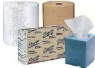
Tissues, Paper Towels or Napkins